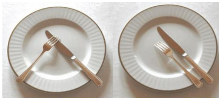
Continental style - I'm resting position